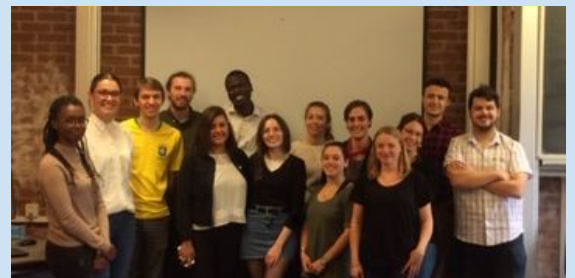
The Human Rights Law Clinic students after the final workshop

To find out more, visit the website of the Sussex Centre for Human Rights Research: